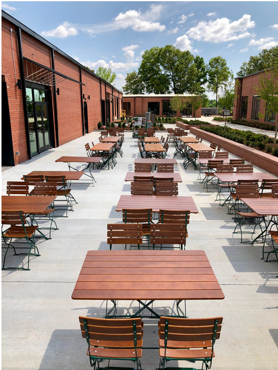
One of the three outdoor patios at Brewers at 4001 Yancey

The Rail House will fill in a link across the Blue Line Extension between growing North End, NoDa and Villa Heights. This part of North Tryo Street is currently aging and very unfriendly to pedestrians. Developments like this will help improve it.